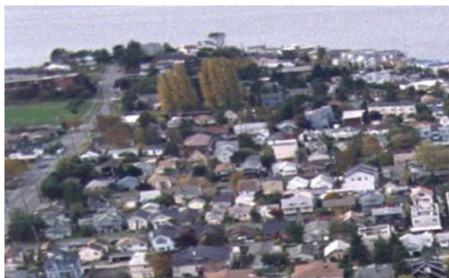
How can we make this...

Rain: Slow it, spread it, filter it, soak it in – restore the sponge. In the forest, rain gets slowed down by tree needles and leaves, then spread out over spongy soils and plants that filter out pollution, slowly letting the rain seep down into the groundwater that keeps our streams running cool all summer. We can help our towns and cities work more like the forest by taking some simple steps during our building and landscape construction, often called “Low Impact Development.”