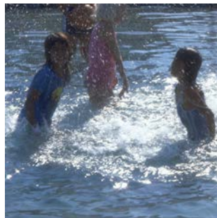
restore our waters for people...