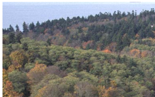
...work more like this?